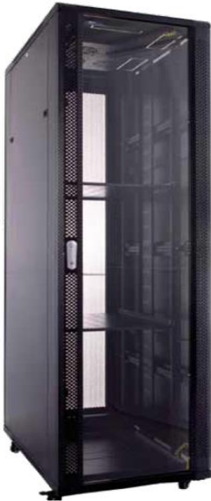
Reference image only

Rack Technologies RTX Free Standing Cabinets are a perfect solution for Small to medium business, low density commercial and communication room environments. RTX Cabinets are supplied fully assembled to provide cost effective and efficient rack equipment installations and maintenance. With multiple door options and a list of standard "extras" including shelves, Power rails, Fans and cable management systems the RTX series outperforms any competitor offer.