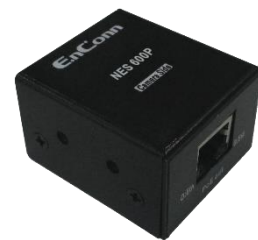
Receiver (Camera Side)