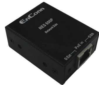
Transmitter (Network Side)